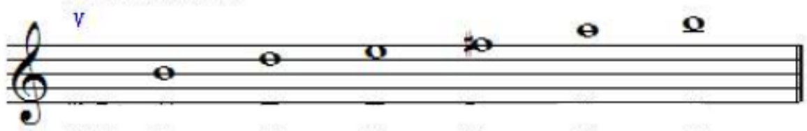
Figure 1 interval relations of pentatonic modes (Gong, Shang, Jiao, Zheng, Yu from left to right)

In the basic theory of music, the tonal scale can be defined as the "skeleton" of music, while in the perspective of the tonal scale, western music and Chinese music are quite different, that is, the Western tonal scale is 1, 2, 3, 4, 5, 6, 7, while the Chinese tonal scale is Gong, Shang, Jiao, Zheng, Yu. This tonal scale has a pure five degree interval relationship (see Figure 1). The basic the basic tone is composed of big two and small three, unlike the semitone in the western scale. Under this condition, piano works based on Chinese pentatonic scale have appeared in the field of western music art for a long time. For example, Schubert's unfinished Sonata in C major embodies pentatonic scale, that is, the triad at the Ninth Section of the score is pentatonic scale, through which the Impressionism color of this section is more distinct. Perhaps because of the success of the unfinished Sonata in C major, more and more western pianists began to use the pentatonic scale in the subsequent western piano works, such as the modern qierpin piano etude of pentatonic, which was in the process of qierpin's Chinese tourism, through qierpin's personal experience and his wife's influence (qierpin's too much Tai is a Chinese). Through the exhibition of the pentatonic scale, it once again shows the charm of the Chinese pentatonic scale to the western music art field, and at the same time enriches the creative thinking of the pianists.