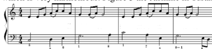
Figure 3 music score of jasmine

Melody is very intuitive in music. It can be said that whether a music work can make the listener feel and have a profound impact on the listener depends on melody (to a certain extent) [3]. The melody of Chinese music works is closely related to Chinese culture, so influenced by the cultural uniqueness, there is a big difference between Chinese melody and Western melody, which causes a heated exploration of western piano music. For example, in Puccini's Turandot, there are fragments of China's traditional folk song "Jasmine", and the melody of this folk song is also used by arianski as an element of etude creation. In addition, Chinese melody is reflected in most western piano works in the form of Rondo, which can well integrate Chinese and Western melodies. For example, in ariansky's No. 25 etude, the Rondo is used, and the beginning of the tune uses the harmony of western major minor, which is very harmonious. Figure 3 the Jasmine in Turandot.